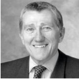
John F. Lehman