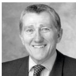
John F. Lehman

Chairman, J. F. Lehman & Company, New York, New York, since 1990; Chairman of the Board, OAO Technology Solutions, Inc., Greenbelt, Maryland, since 2001; Chairman of the Board, Sperry Marine Inc., Charlottesville, Virginia, 1993 to 1996; Managing Director, Investment Banking Division, PaineWebber Inc., New York, New York, 1988 to 1990; Secretary of the Navy, Washington, D.C., 1981 to 1987. Age 62.