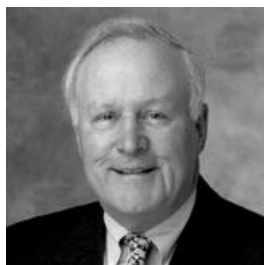
Howard M. Dean

To Continue in Office Until the 2006 Annual Meeting (Class III)